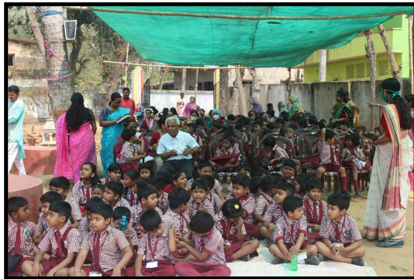
Students at Village Model School participated on 08 th March