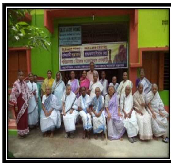
The Old Age Home of VWS, Anandam