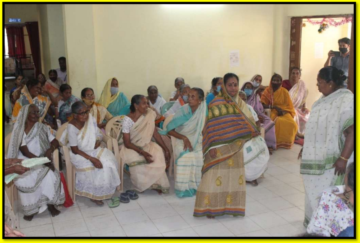
Role Play by the Old Age Inmates on 08 th March